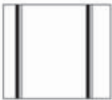
PATTERN A STRIPES 1/16"-1/16" adjacent stripes