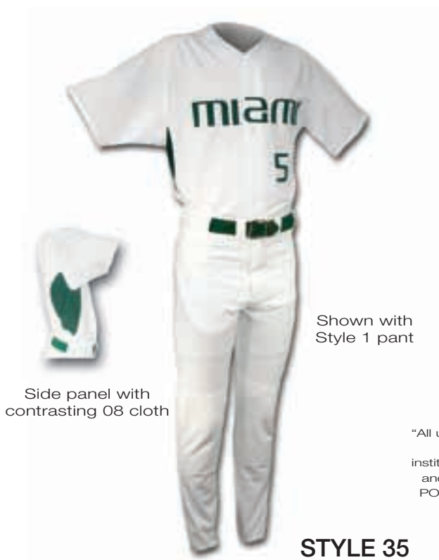
Shown with Style 1 pant