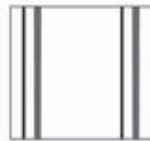
PATTERN 'TOROS' STRIPES 1/16"-3/16"-1/8" adjacent stripes

MLBBP1-70 patterns BB1, BB2, or BB3 white or color with any color pinstripe 124.00