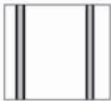
PATTERN BB2 STRIPES 1/16"-1/8"-1/16" adjacent stripes