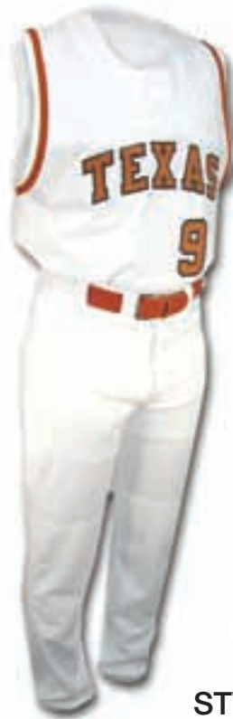
Shown with 1/2" armhole braid option