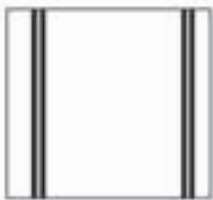
PATTERN BB1 STRIPES 1/16"-1/16"-1/16" adjacent stripes