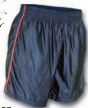
Short shown with optional 1/8" piping