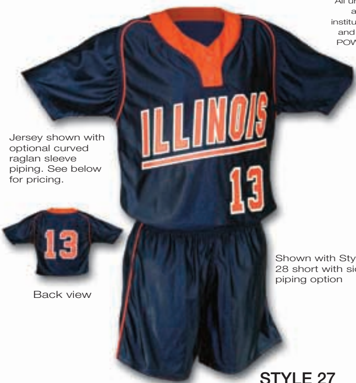
Jersey shown with optional curved raglan sleeve piping. See below for pricing.

"All university logos, colors and names are property of the respective institution, are for display purpose only and are in no way affiliated with the POWERS Manufacturing Company"