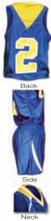
STYLE 35 NEW