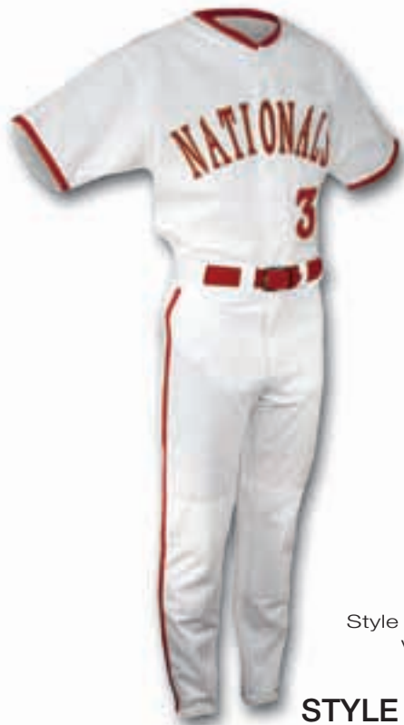
Style 8 pant pictured with jersey