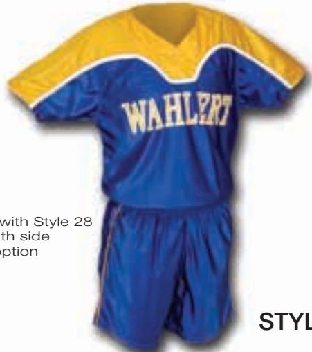
Shown with Style 28 short with side piping option