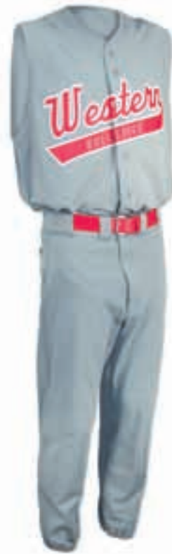
STYLE 12 PANT Clemson style

Jersey and pant shown in Charcoal Grey. Available in 70 and 110 cloth only. Style 1 pant is pictured with jersey.