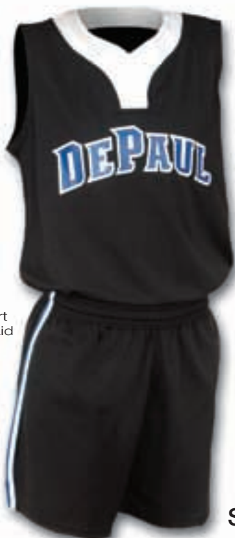
Shown with Style 28 short with 1/2" braid

"All university logos, colors and names are property of the respective institution, are for display purpose only and are in no way affiliated with the POWERS Manufacturing Company"