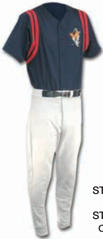
STYLE 13 JERSEY